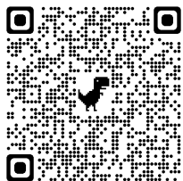
Marriott Hotel & Convention Center